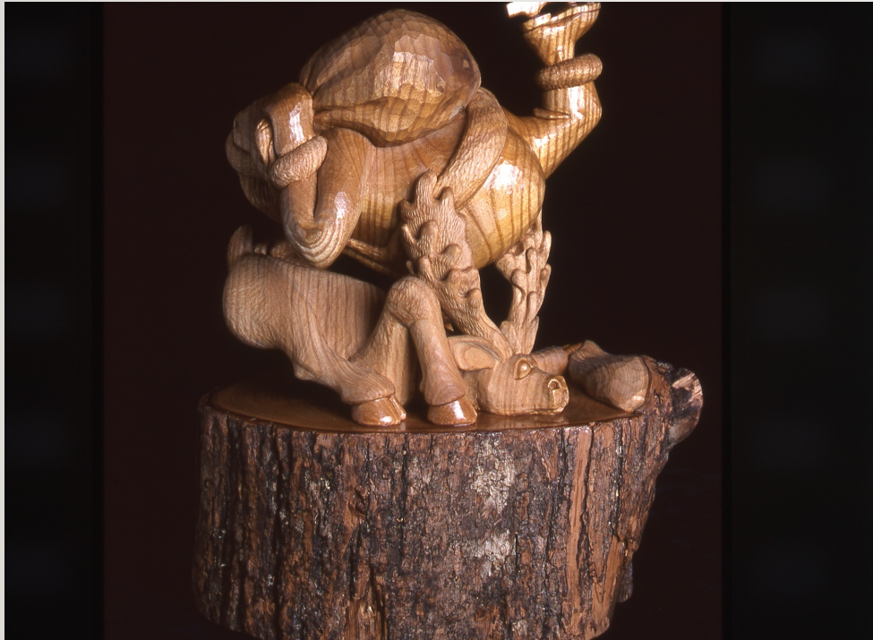
TIGHT FOR DETAIL