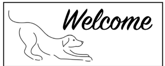
Dogs Welcome Sign

The incised style carves lines into the surface of wood and can be done safely with one tool. This workshop is for those who have never carved or for carvers who have no incised experience. Students will be provided with free basswood, a loaner tool, patterns, and a carving mat. This workshop will be taught on-line with Zoom and simultaneously in-person, unless Covid gets much worse.