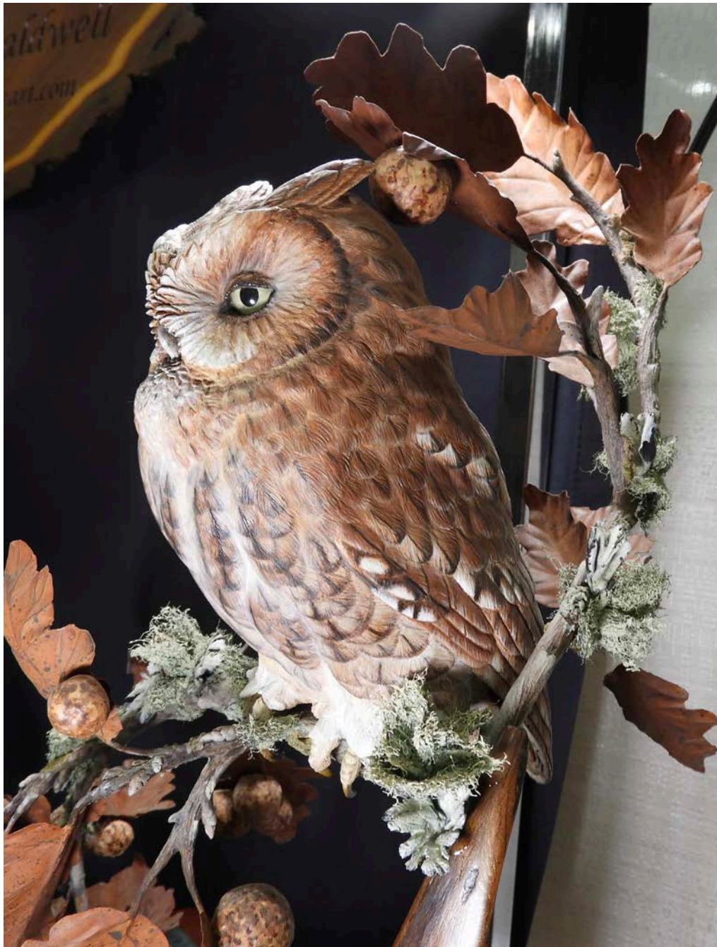
Owl carving by Judy Caldwell

We will resume our 2nd Tuesday monthly meetings starting September 13th, 7:00 PM on Zoom.